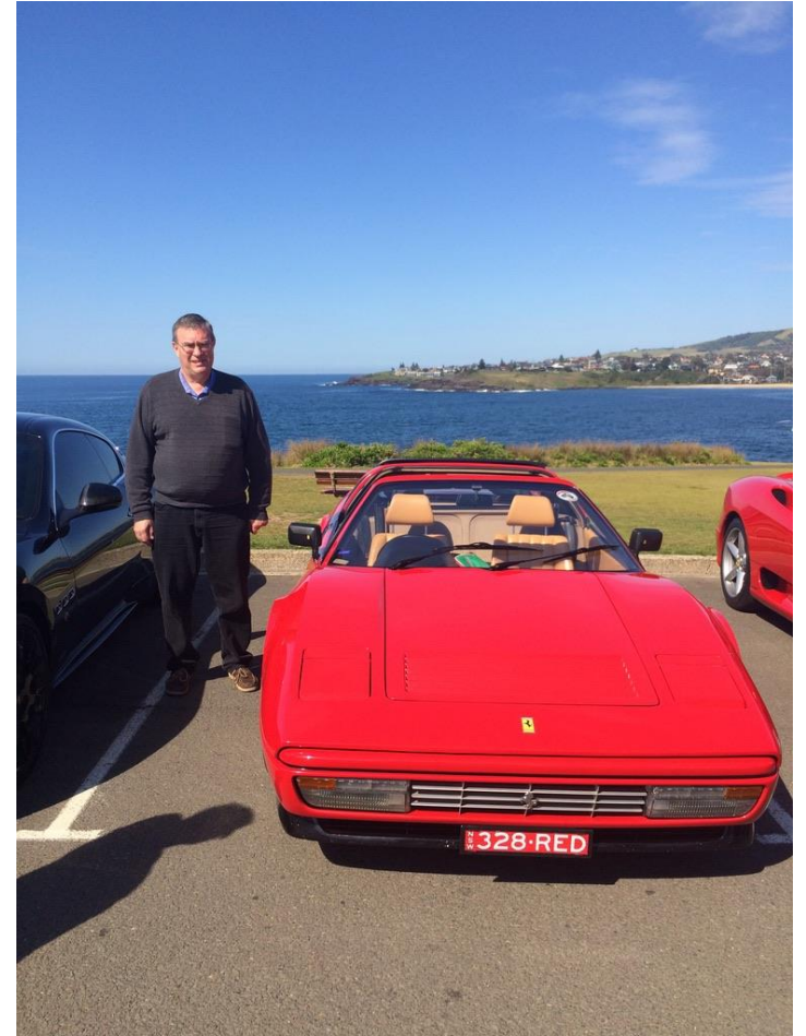
Kiama, NSW, 2015