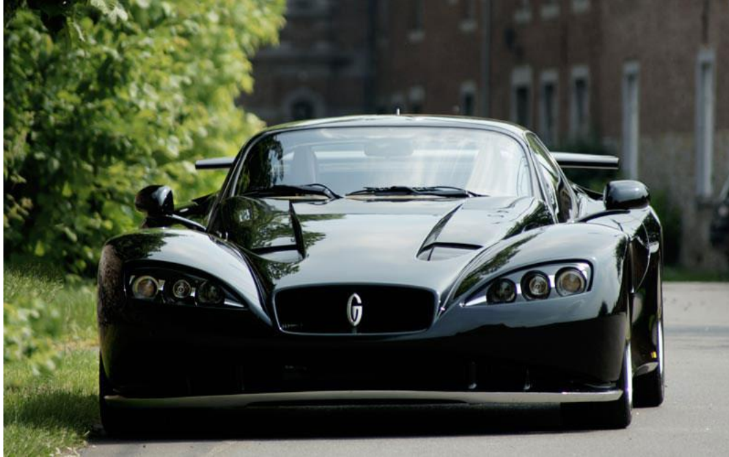
Gillet Vertigo.5 Spirit Belgium SuperCar