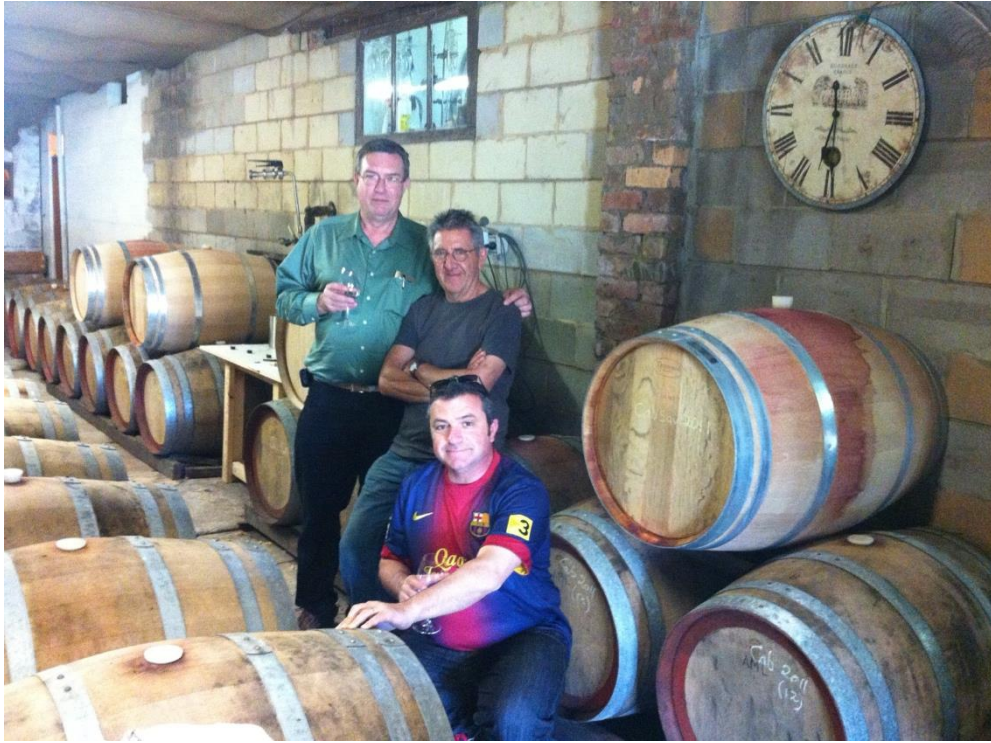
somewhere around Canberra, 2013